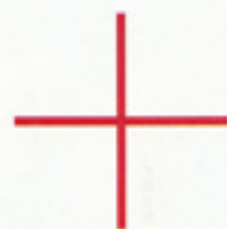
Photo Contest Winners Revealed!